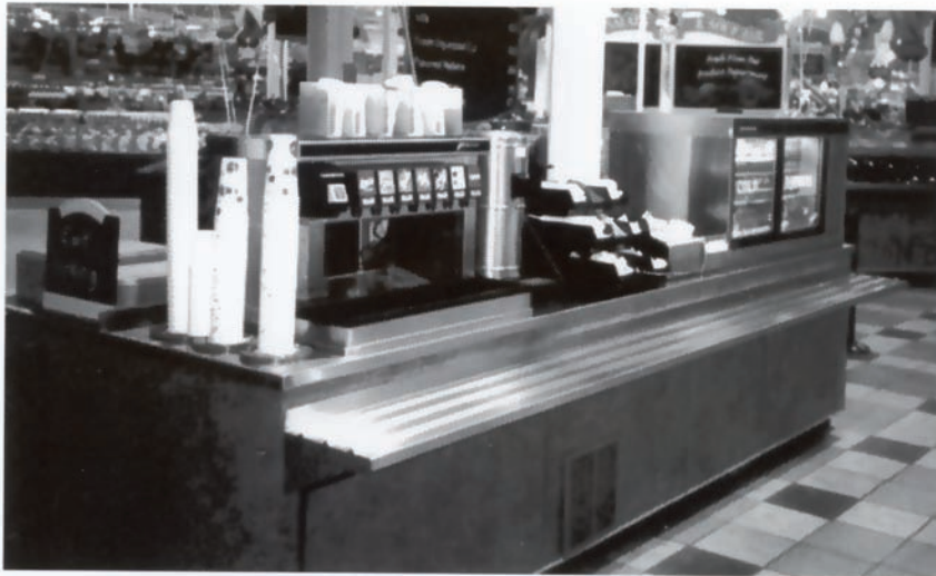
Stainless Steel Countertop and Trayslide