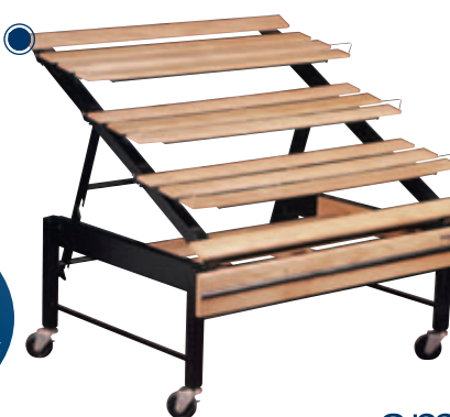
Highly versatile slant racks

Custom, Standard & Quick Ship Items Available!