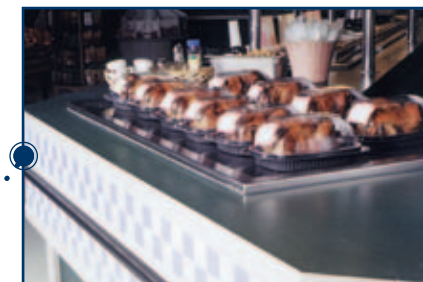
Hot food displays