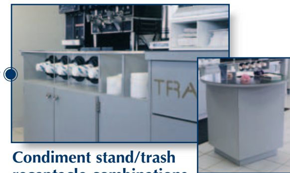
Condiment stand/trash receptacle combinations