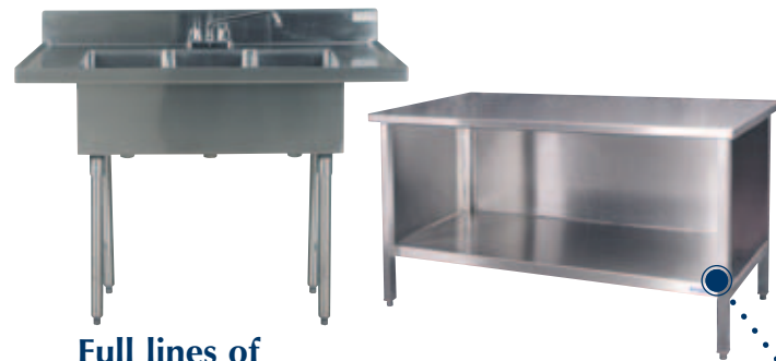
Full lines of NSF-listed stainless steel sinks, worktables, and wall shelving

No size, configuration or finish is too tough for Amtekco. Many standard items are available, or we can design a custom solution to meet your store's specific needs. Our value engineered products are extremely cost-efficient and our turnaround is very timely. Many Quick Ship items also are available for immediate delivery. Whether you need a single item or an entire store of equipment, Amtekco will be your partner to help you map out a solution.