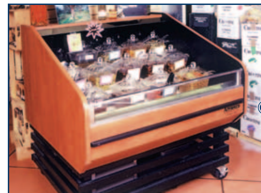
Open refrigerated display cases