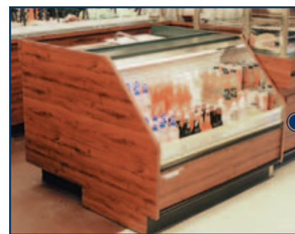
Service or self-service display cases